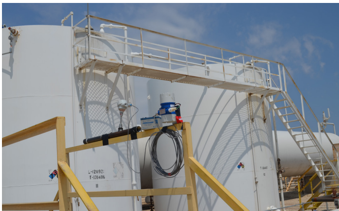
A portable Fox Thermal flow meter kit used at oil and condensate storage tanks for emissions requirements.