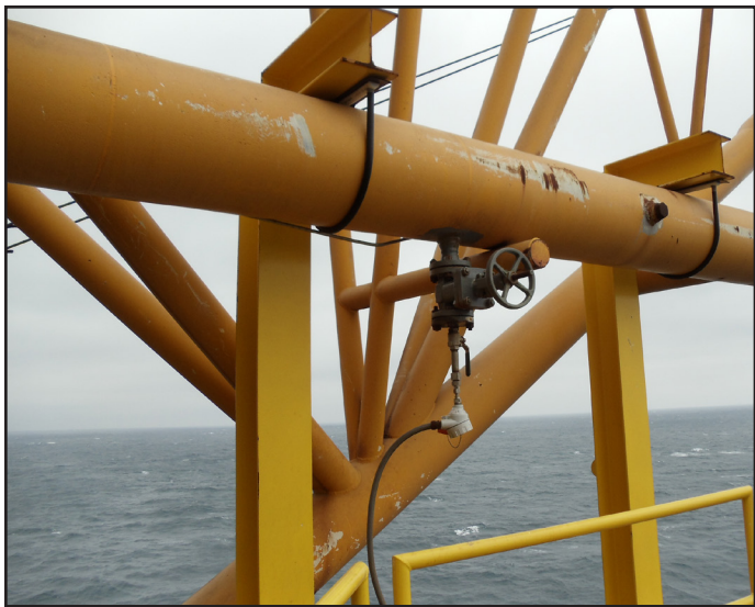
A Fox Thermal flow meter in a remote configuration used to measure flare gas at an offshore drilling rig.

Gas composition is another challenging aspect of flare and combustor gas. The variability in gas composition makes it imperative that the flow meter be calibrated to measure the mixture of flare/combustor gas constituents at each site. Likewise, a method of verifying the calibration of a meter at periodic intervals allows operators to be confident that they are collecting the most accurate information at each site.