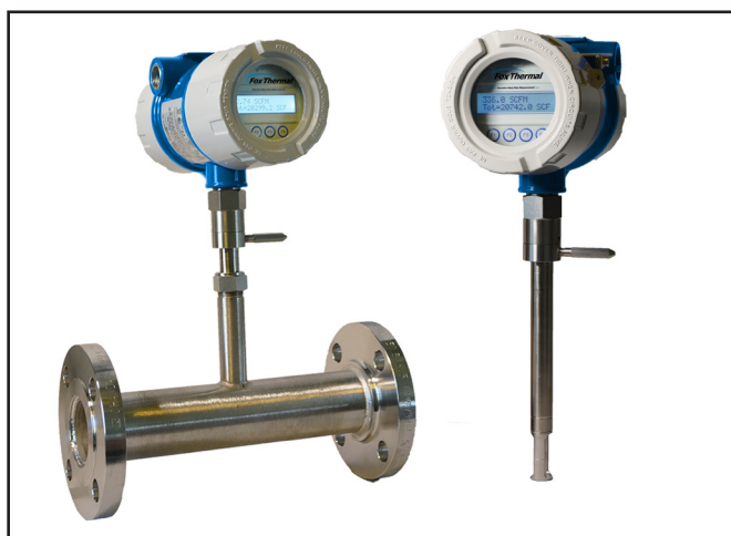
Fox model FT4X thermal mass flow meter and temperature transmitter. Flow Accuracy, air: \pm 1\% of reading, \pm 0.2\% of full scale; Flow Accuracy, other gases: \pm 1.5\% of reading, \pm 0.5\% of full scale Turndown ratio: up to 1000:1 Available in insertion, inline, and remote styles.

Perhaps due to the overwhelming data amassed from these reports, the EPA has begun to regulate the amount of emissions allowed in certain industries. Recently, the Natural Gas Production industry has been required to reduce their emissions by 95% in some cases in order to comply with the Quad O regulation. This 2012 ruling requires that waste gas be recovered using Vapor Recovery Units (VRUs) or combusted using flares, combustors, or other combustion devices to cut down on the