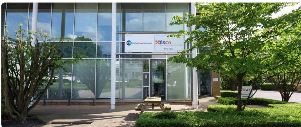
IFIS office, Winnersh Triangle, Berkshire, UK

We are based in offices near Reading. Our 16 staff work closely with partners in India, the US and China. We currently have 5 trustees (non-executive directors).