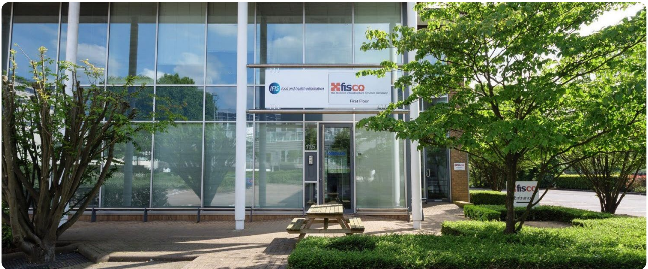
IFIS office, Winnersh Triangle, Berkshire, UK

We are based in offices near Reading. Our 16 staff work closely with partners in India, the US and China. We currently have 5 trustees (non-executive directors).