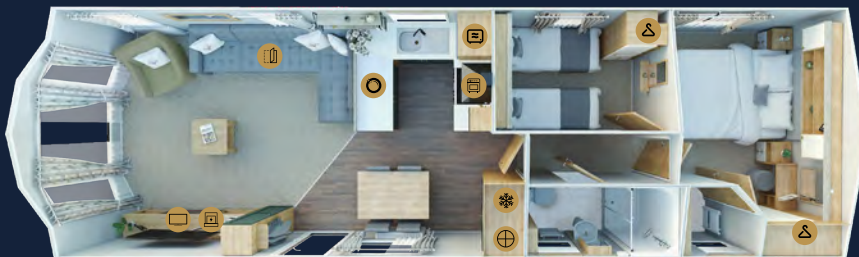
38 x 12 • 2 bedroom • sleeps 6