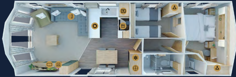
35 x 12 • 2 bedroom • sleeps 6