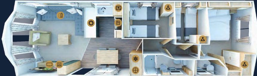
38 x 12 • 3 bedroom • sleeps 8