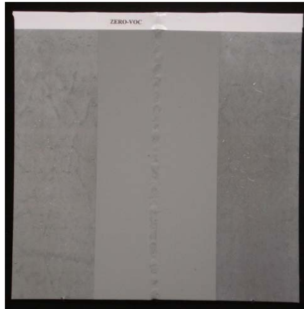
Figure 5 Showing test piece after application of ZRC Zero-VOC.

Two coats of ZRC Zero-VOC were applied from randomly chosen cans (after blending and straining) by brush to a total dry film thickness of 2.8 mils (recorded with a Positector 6000 series magnetic film thickness gauge, per SSPC-PA 2), allowing a 24-hour dry time at 25°C between coats. ZRC Zero-VOC was overlapped 1.5 inches over the galvanized surface on either side of the weld. Figure 5 shows the panel after ZRC Zero-VOC application.