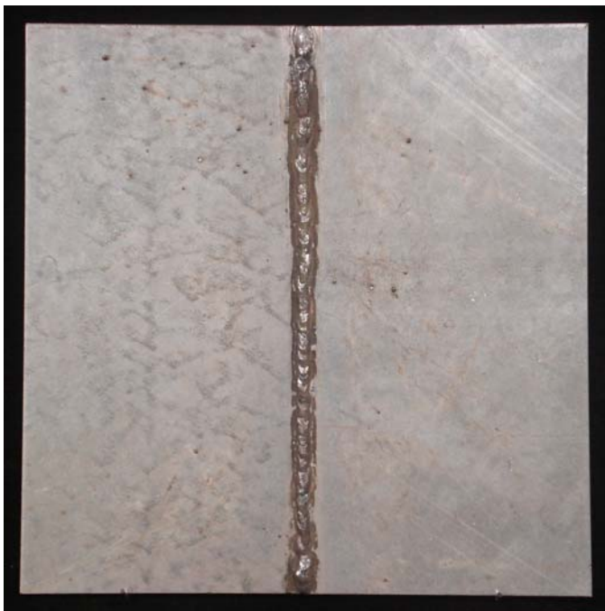
Figure 3 Showing a representative test piece after MIG welding.

In this experiment, 11 gauge panels of G90 specified hot-dip galvanized steel (ASTM A 526) were obtained from Ledford Steel Company, Winchester, KY and employed as the substrate. Two panels of the substrate were MIG-welded together to create the test area. Figure 3 shows the test piece after welding. The welded area was then Power Tool Cleaned (SSPC-SP 11). The surrounding area was Hand Tool Cleaned (SSPC-SP 2). The surface of the whole test piece was then Solvent Cleaned (SSPC-SP 1) using MEK. Figure 4 illustrates the test piece after cleaning.