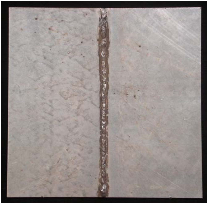
Figure 3 Showing a representative test piece after MIG welding.

In this experiment, 11 gauge panels of G90 specified hot-dip galvanized steel (ASTM A 526) were obtained from Ledford Steel Company, Winchester, KY and employed as the substrate. Two panels of the substrate were MIG-welded together to create the test area. Figure 3 shows the test piece after welding. The welded area was then Power Tool Cleaned (SSPC-SP 11). The surrounding area was Hand Tool Cleaned (SSPC-SP 2). The surface of the whole test piece was then Solvent Cleaned (SSPC-SP 1) using MEK. Figure 4 illustrates the test piece after cleaning.