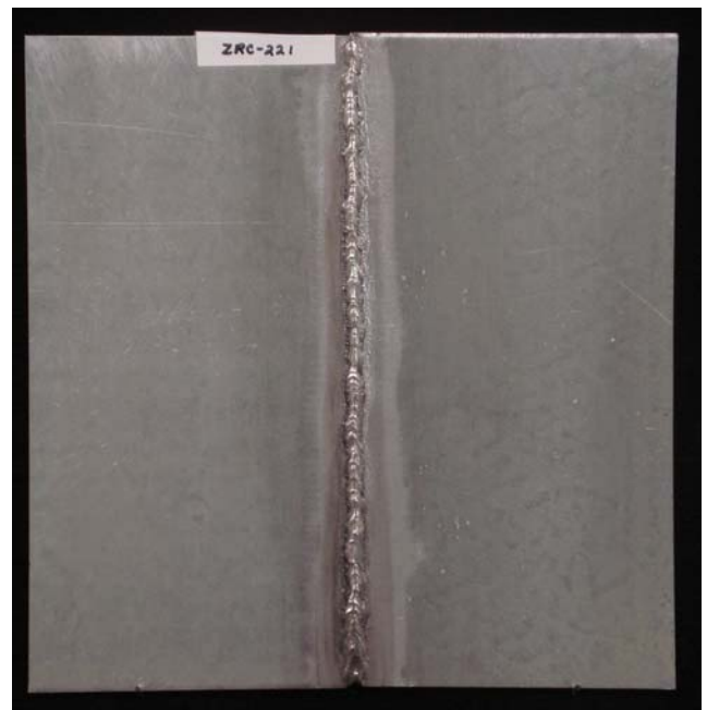
Figure 4 Showing ZRC-221 test piece after surface preparation.