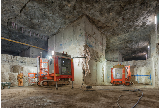
Fig. 12. An uneconomic horizon of (often cross-bedded) chert nodules and limestone at the base of the Whitbed is routinely removed using a hydraulic breaker. The GU mining machines are able to cut this chert but because of its relative hardness, diamond usage often increases to unacceptable levels.

Fig. 11. Work to bench-mine the Basebed then began, following the footprint of the Whitbed and Roach workings, leaving all of the pillars in situ but increasing their height to around 9 m.