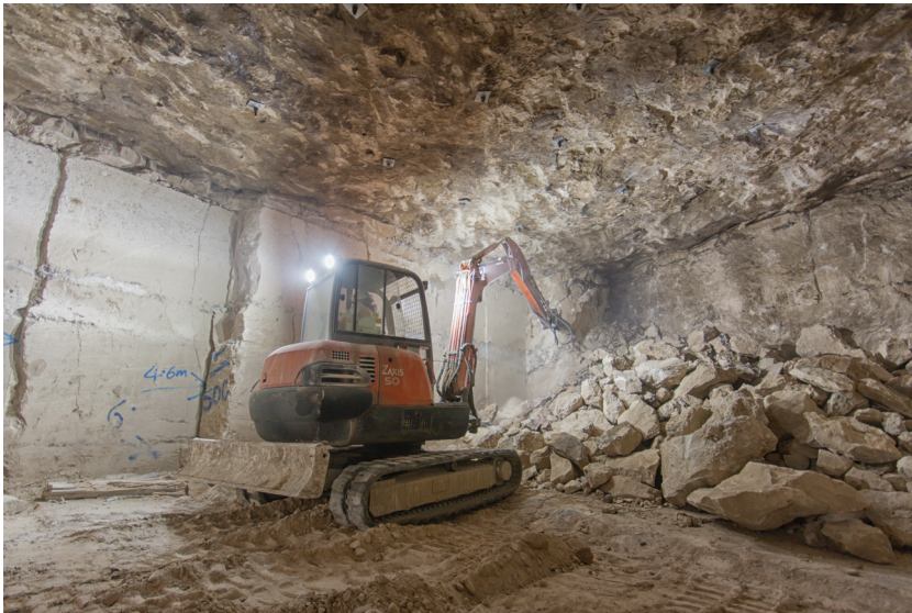
Fig. 6. After the blocks of dimensional Portland Stone have been removed, some trimming of the roof to remove the thin Transition Bed and Basal Dirt Bed (which overlie the Roach) together with the removal of any irregularities in the newly exposed face is undertaken, using a backhoe-mounted hydraulic breaker. The mine roadway has advanced up to an extensional joint and excess rock is being removed to create a new flat working face.