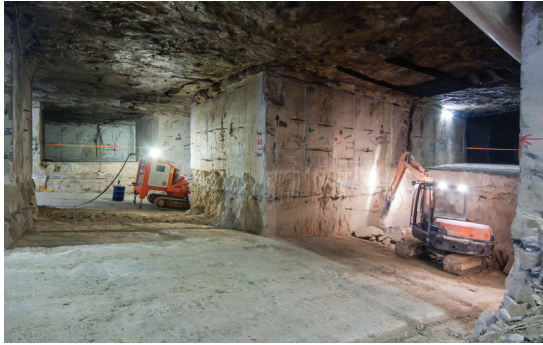
Fig. 11. Work to bench-mine the Basebed then began, following the footprint of the Whitbed and Roach workings, leaving all of the pillars in situ but increasing their height to around 9 m.

Fig. 10. Two ramps were cut in parallel to provide workers with more than one means of emergency egress. The ramps were incrementally extended until they reached the bottom of the Basebed (coincident with the top of the Portland Stone Formation's Chert Member).