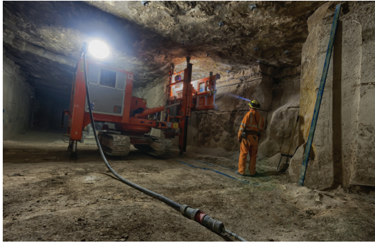
Fig. 3. Fantini GU mining machines are used to make 1.8 m deep (vertical and horizontal) cuts into faces to be extracted. This results in a number of cantilevered blocks, with sawn edges, attached only on their rear faces.

Fig. 2. The roof within Jordans Mine is coincident with the upper surface of the Lulworth Formation's Basal Dirt Bed. As a consequence the mine's roadways all dip at a couple of degrees (following the strata) to the south-east.