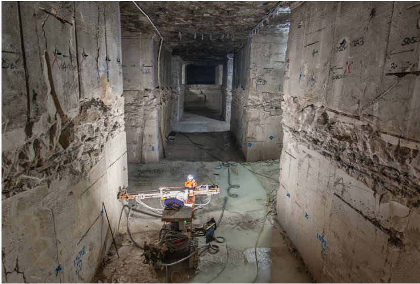
Fig. 14. Following removal of the Basebed, the resultant full height pillars are also given rib-support at this horizon with the aim of preventing joint controlled pillar failure.