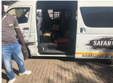
Additionally, the Gondwana Care Trust has been delivering meat and other dry goods to the Meals for Two recipients who are still open and providing food to their communities.