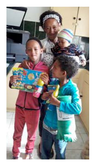
Donation was done just before Easter and the kids just got spoiled with some chocolates