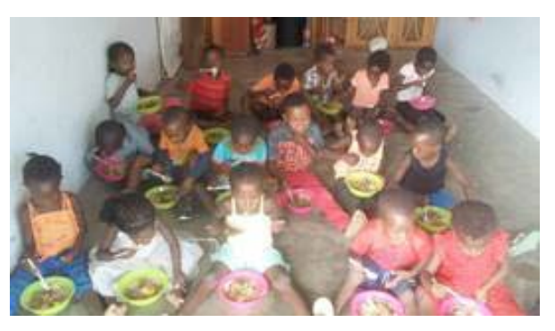
Soup kitchen for vulnerable children - meat donated by Gondwana Care Trust and carrots were also donated recently to add the much-needed vegetables into the pot.