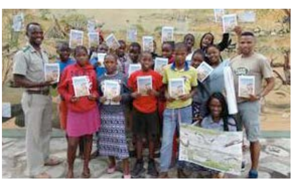
Grade 7 learners from Dawid Khamuxab Primary School learning about conservation and many other skills taught at the Centre without forgetting the 3 R's - Reduce / Reuse / Recycle