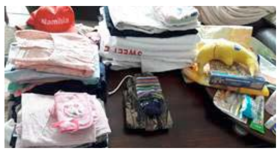
Clothing and hygienic/baby products