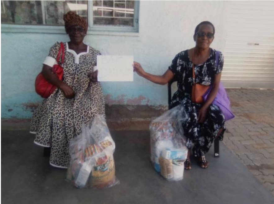
Delivery for Seniorspark – Old Age home – 160 residents – Windhoek

please contact us so we can devise a plan of action to co-ordinate efforts in assisting the community.