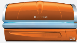
Xtreme Orange Metallic