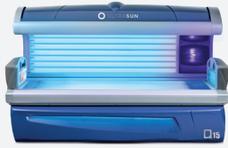
Royal Blue Metallic