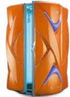
Xtreme Orange Metallic