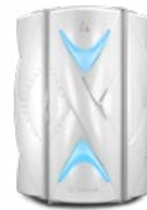
Dream White Metallic