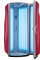
Fancy Red Metallic