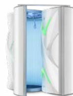
Dream White Metallic