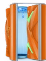
Xtreme Orange Metallic