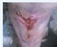
Fig 2: 19 weeks after treatment with KTwo