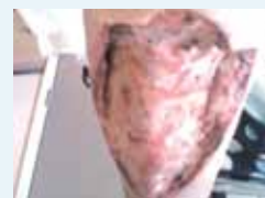
Fig 1: Six weeks after the fall following debridement