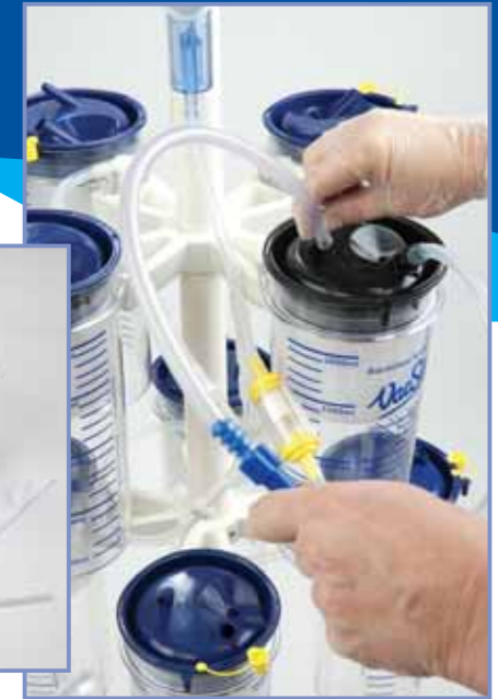
1, 2 & 3 Litre Liners and Canisters.