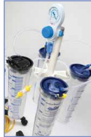
Cascade Stand detail

BactiClear® Antimicrobial Disposable Suction Range from VacSax® the product of choice