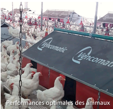
Performances optimales des animaux

The Vencomatic Nest Condor suits both natural and tunnel ventilated houses. The lay-out is comparable to a layout for manual nest boxes. It exists of two rows of nest-blocks and walkovers. The change from manual to automatic egg collecting system will be a small change in management. The winchable nesting system facilitates bird training and cleaning of the house and nesting system in between rounds. All these features result in better economic performances and lower operational costs.