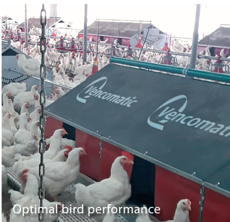
Optimal bird performance