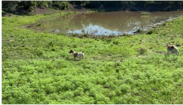
Check: Water Point