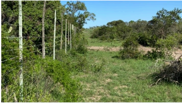
Check: Gate Check