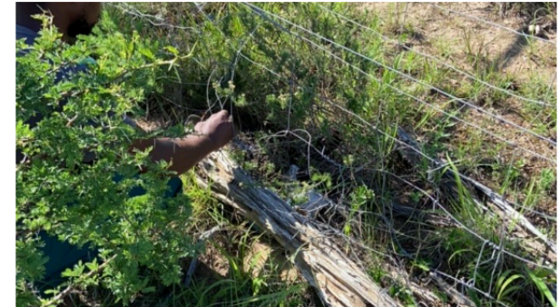
Check: Fence Check 700m - 800m