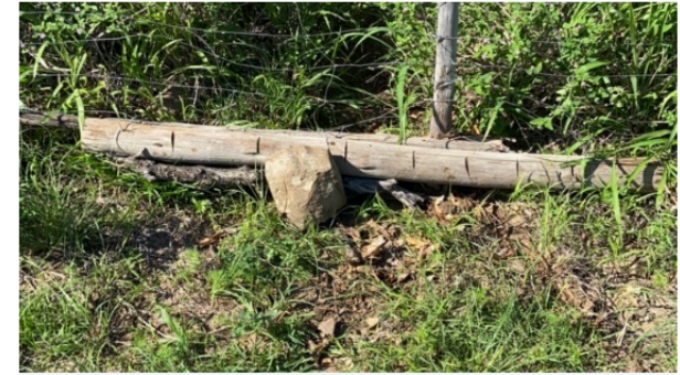
Check: Fence Check 0-100m