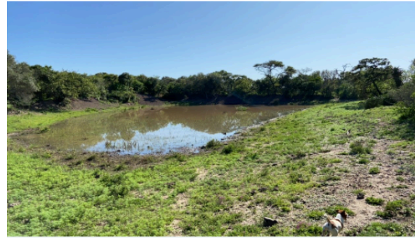
Check: Water Point