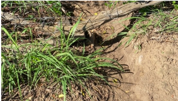
Check: Fence Check 300 - 400m