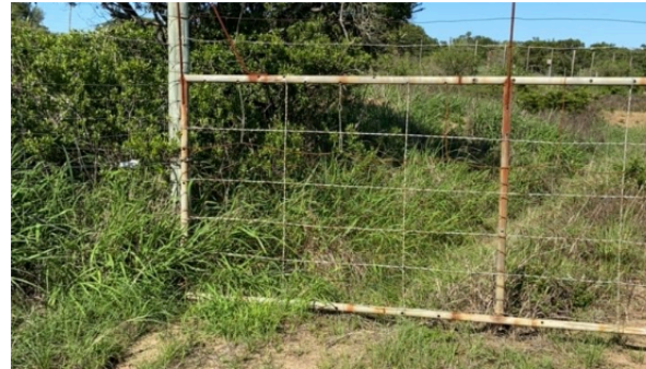
Check: Fence Check 700m - 800m