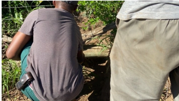
Check: Fence Check 300 - 400m