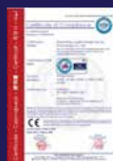
Prefab house CE