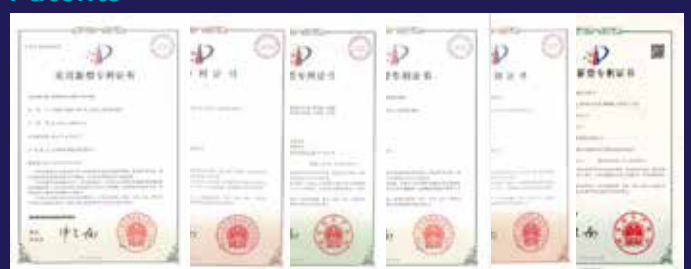
The company pays attention to product innovation and has 20 patents, including 5 invention patents and 15 new patents.