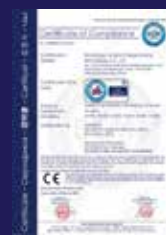
Thermometry Disinfection Channel CE