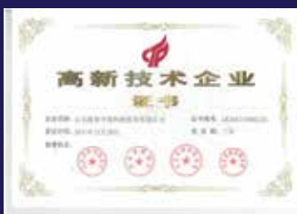
National High-Tech Enterprise