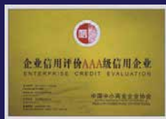
Enterprise Credit Evaluation AAA Credit Enterprise