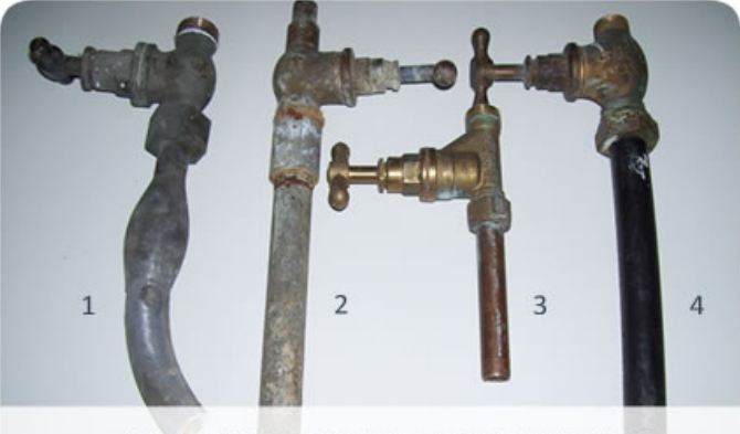
1) Lead 2) Iron 3) Copper 4) Black Poly/Alkathene

Open the flap of the stop tap or water meter box outside your property and examine the pipe - this may not be possible as access is often difficult. You may not have an external boundary box if your house is very old.