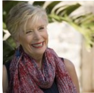
Maggie Beer AM