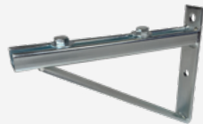
WALL BASE MOUNT