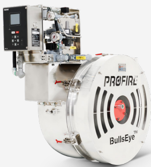
FLAME ARRESTOR HOUSING MOUNT