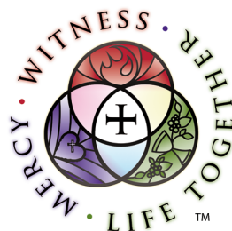
Concordia Theological Seminary Fort Wayne

Please visit us online at www.lcms.org/jointseminaryfund .