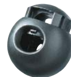
LC-SB Compact Round Design Polyacetal Size: 1/5"