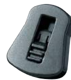
LC-WF Inner Lock Type Cord Stopper Polyacetal Size: 1/5"