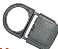
LE-D Clip-Lock Type Tape End Polyacetal Size: 1"