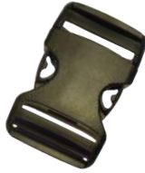
LB-PF Superior Performance (UL) Polyacetal Sizes: 1", 1.5"