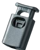
LC-SC Single Cord, Flat Design Polyacetal Size: 1/5"