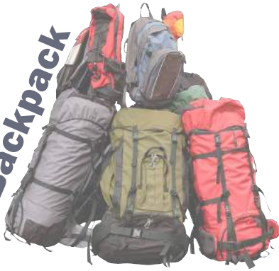
LB-LW/LWD Ultra Light Weight Polyacetal Sizes: 5/8", 3/4", 1", 1.5"