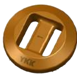
LA-SB Slide Button PA Size: 5/8"