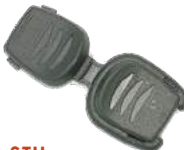
LE-STU Hinge Type Dual Cord End PA Size: 1/10"