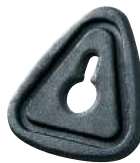
LC-EL Sewable Cord Holder TPE Size: 1/12"