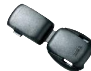
LE-PB Hinge Type Single Cord End PA Size: 1/10"