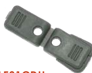
LE01CDH Hinge Type Single Cord End PA Size: 1/10"