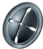
LC-US Sewable Cord Holder TPE Size: 1/12"