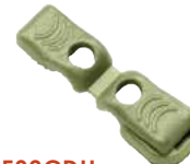
LE02CDH Hinge Type Single Cord End PA Size: 1/10"