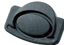
LE-B Sewable Tape End TPE Size: 5/8", 3/4", 1"