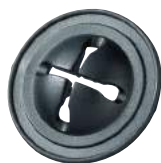
LC-UC Sewable Cord Holder TPE Size: 1/12"