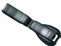
LE-PA Hinge Type Single Cord End PA Size: 1/12"