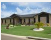
April 2010 005.jpg