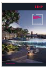
Global Branded Residences – 2019