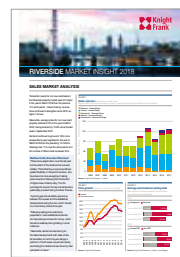
London Riverside Market Insight – 2018