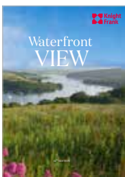
UK Waterfront View 2018 – 2018