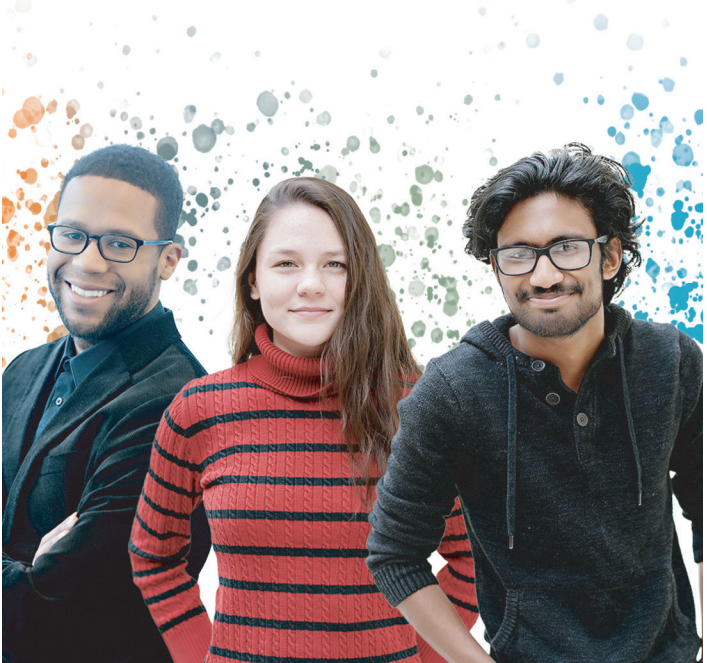
In response to COVID-19, Education at Work has shown our clients that we can quickly pivot, organize and adjust when a crisis occurs and that we can deliver exceptional customer support from a work-at-home environment. We're proud of our agile student workforce which has continued to exceed our clients' objectives remotely.