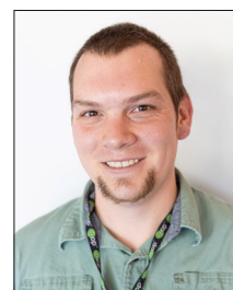
Jonah Curley Grocery