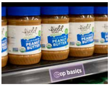
Look for the purple basics signs when you shop!