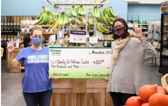
2020 CCF Grant Recipient: Family & Children's Center Viroqua

VFC Cooperative Community Fund was established in 2016 with the specific goal of providing grant funding to local nonprofit organizations