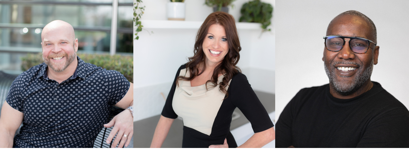
"Don't make fashion own you, but you decide what you are, what you want to express by the way you dress and the way to live."

down 3 words that describe your strengths you want to show in your pictures. Have those words ready so we can talk through them.