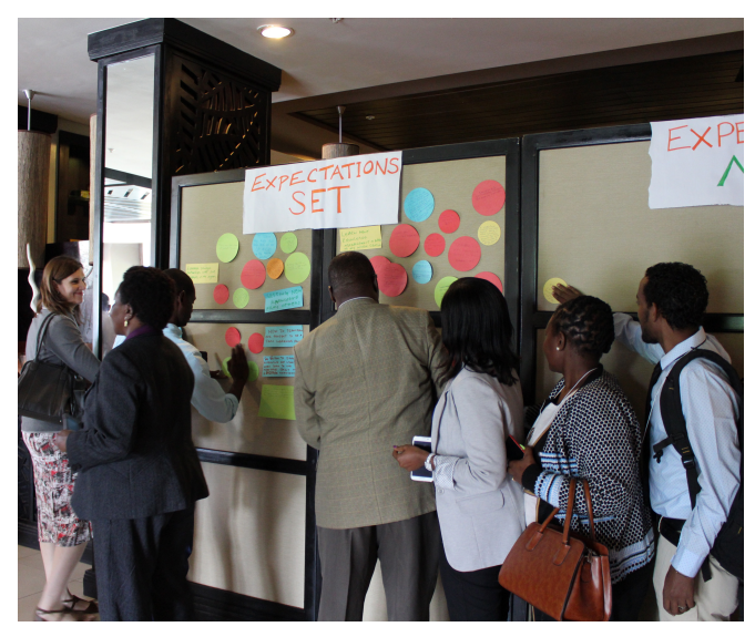
Participants contribute to the expectations wall at the beginning of the East Africa Knowledge Management Share Fair in Arusha, Tanzania.

An expectation wall is another way to conduct an evaluation in real time. This option requires a large wall space, VIPP Cards or large sticky notes, and markers. To facilitate an expectation wall exercise, designate one side of the wall for "Expectations Set" and the other side for "Expectations Met." Then ask participants to write their expectations for the share fair on the card or note (one expectation per card or note). Ask participants to place their card or notes on the Expectation Set part of the wall. Over the course of the meeting, remind and provide designated time for participants to revisit the wall and consider whether their expectations have been met; if so, they should move their sticky note to the "Expectations Met" side of the wall. The wall provides a barometer throughout the meeting to see how well expectations are being addressed.