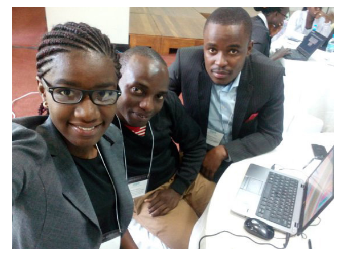
Share fair attendees take a selfie together.