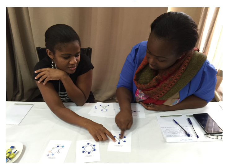
Attendees at the Knowledge Management for Health Share Fair, held in Arusha, Tanzania.

When considering how to organize the agenda, think about innovative ways to present content. Participants are more likely to engage with creative presentations than plenary sessions with PowerPoint slides. To encourage creativity and learning, infuse innovative methods into the agenda—for example, storytelling, knowledge cafés, skits, or music. Think about content that is related, but may offer a different perspective. For example, consider inviting experts from another field or sector to share their best practices as they relate to the main theme of the event. See Appendix D and Appendix E for innovative techniques to adapt. Visit the Liberating Structures website (www.liberatingstructures.com) for more fun and innovative ways to elicit participation and maximize learning.