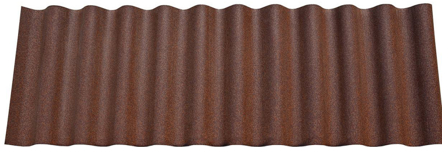
Shown in Weathered Rustic®