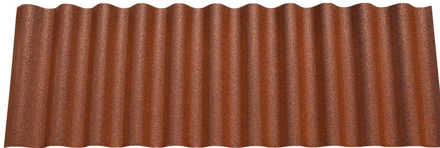
Shown in Weathered Metallic®