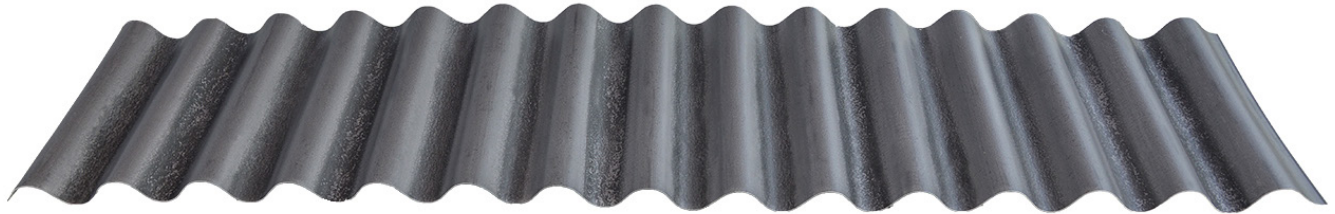
Shown in Streaked Blackened Rust®