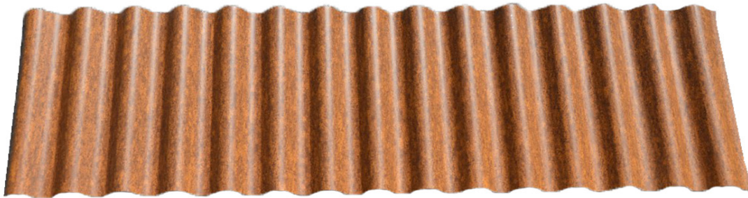
Shown in Speckled Rust®