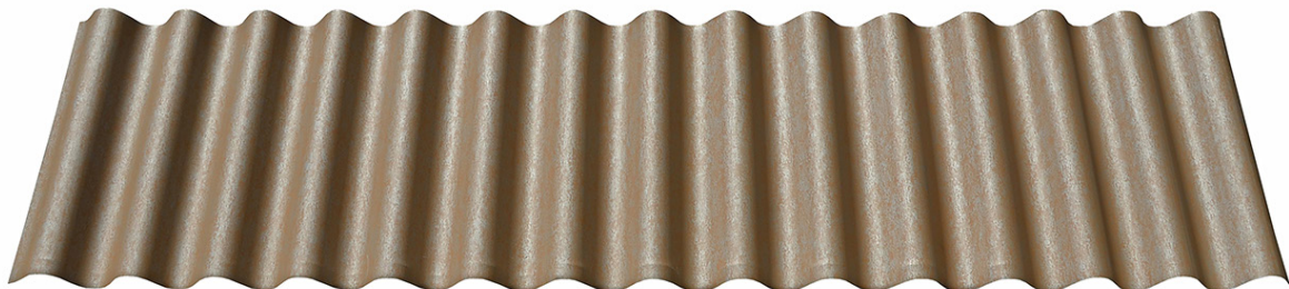
Shown in Speckled Galvanized Rust®