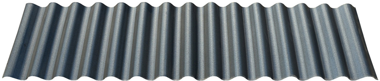
Shown in ReziBond®

****AVAILABLE IN 22 GA / SPECIAL ORDER INQUIRE WITH SALES PERSON