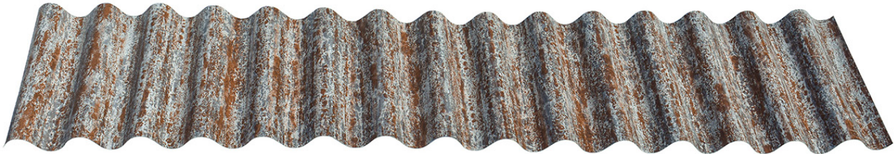
Shown in Reclaimed Metal Rust®