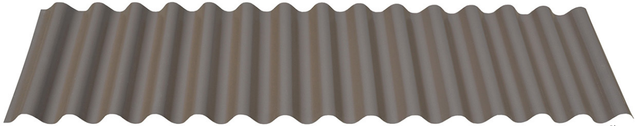
Shown in Patina®