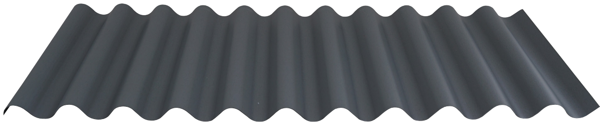
Shown in Matte Zinc Metallic®