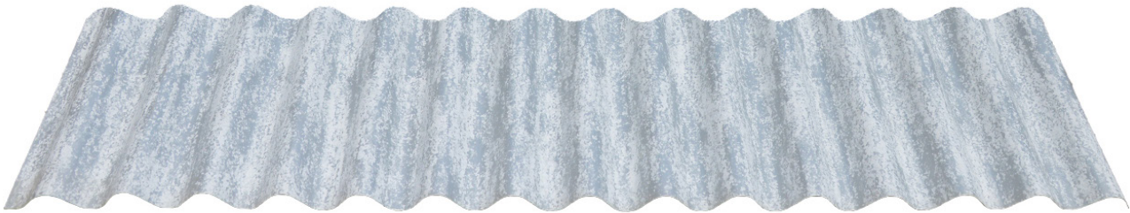
Shown in Galv-Ten Robust®