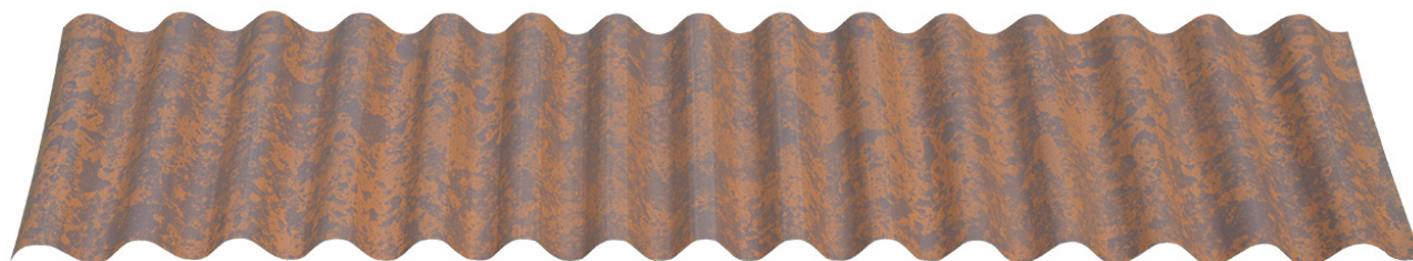
Shown in Fresh Rust®