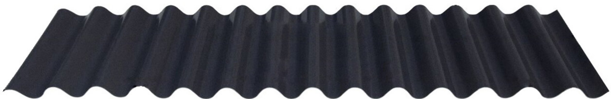
Shown in Dark Bronze