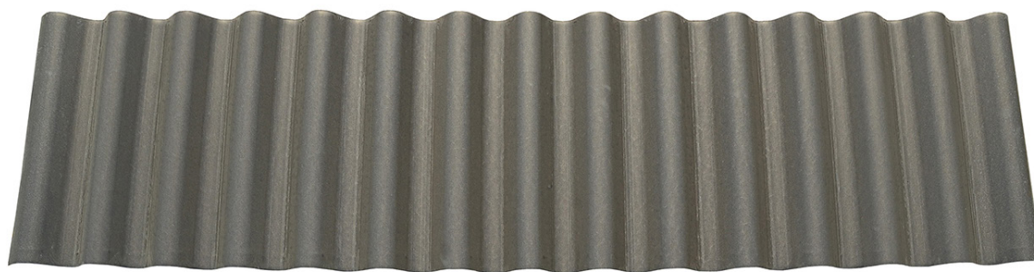
Shown in Bonderized