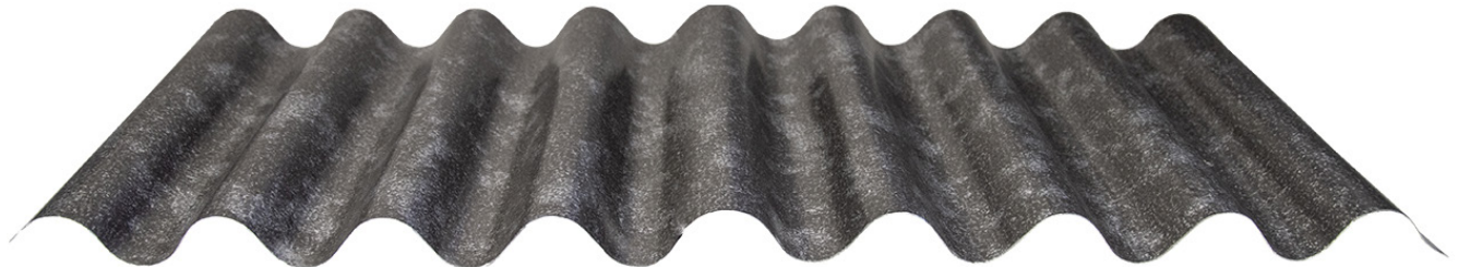
Shown in Blackened Galvanized®