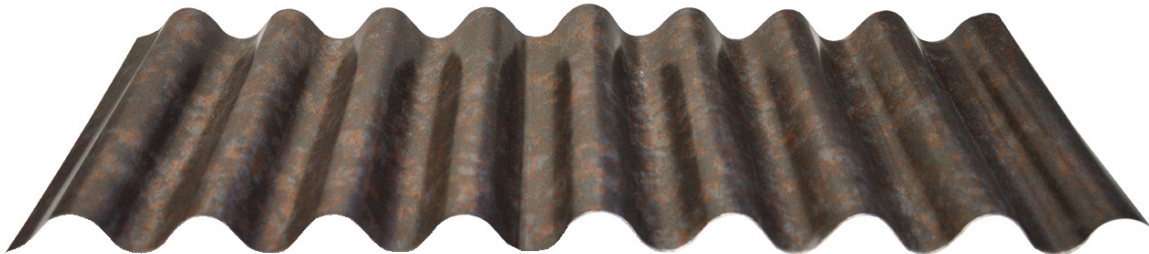
Shown in Blackened Copper®