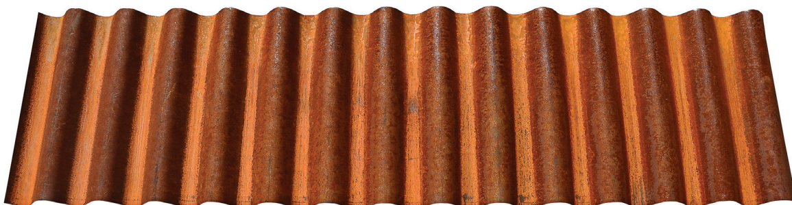
Shown in A606-4 (AKA Corten®)

***Material does not arrive pre-rusted. Panel will rust naturally with exposure to the weather. Use stainless steel screws with a painted brown screw head for installing the panels.