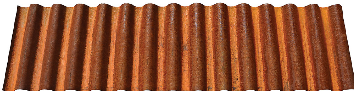
Shown in Bare Steel

***Material does not arrive pre-rusted. Panel will rust naturally with exposure to the weather. Use galvanized or stainless steel screws with a painted brown screw head for installing the panels.